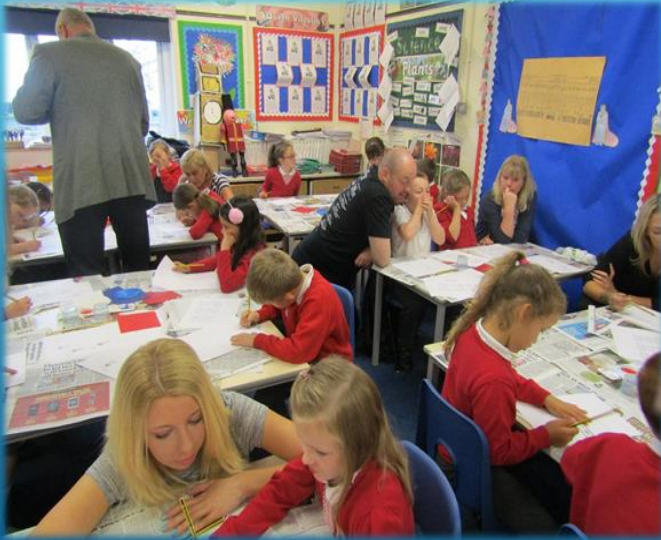
Family Learning Day. Year Two