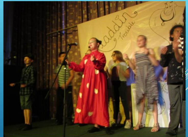
Year Six End Of Year Production.