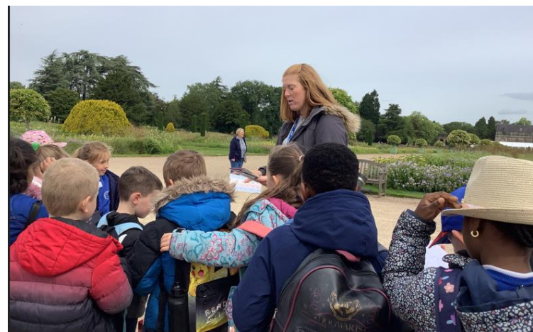
PICTURE CAPTION: Lorem ipsum dolor sit amet, consectetur adipiscing elit.